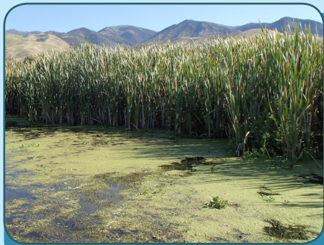
thick duckweed and algae

Improve wetland water quality. While wetlands can help filter sediments, nutrients, and other contaminants from water, high levels of input can exceed wetland capacity for filtration and alter natural wetland dynamics. These water-quality stressors can then be passed along to adjacent streams and lakes. Improve wetland water quality through the use of best management practices such as water-wise landscaping, picking up after pets, and minimizing soil disturbance adjacent to and within wetlands. For more tips, visit http://www.utahcleanwater.org/best-management-practices.html .