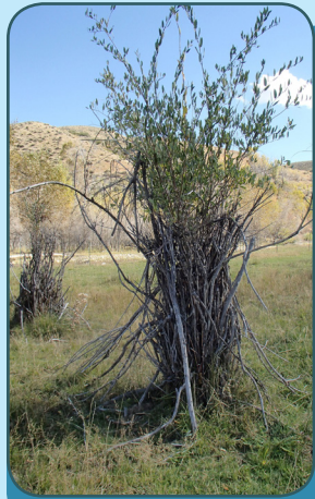
heavily grazed willow