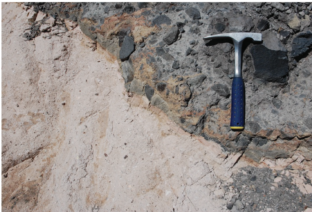
Figure 2. Close-up view of gray- and black-colored Panguitch Lake volcanics (sample PLV1) at upper right. Same location as figure 1.