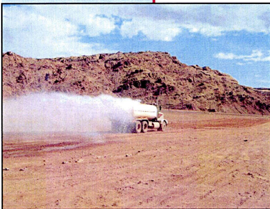
Water is applied at the project site to control fugitive dust.

In July 2005, DOE published the final EIS that presented the preferred alternatives of active ground water remediation and off-site disposal of the tailings pile and other contaminated materials at the proposed Crescent Junction, Utah, disposal site using predominantly rail transportation. The preferred alternatives included cleanup and reclamation of the millsite property and certain off-site properties known as vicinity properties. DOE issued the Record of Decision in September 2005, which detailed the selection of the preferred alternatives and the basis for that decision.